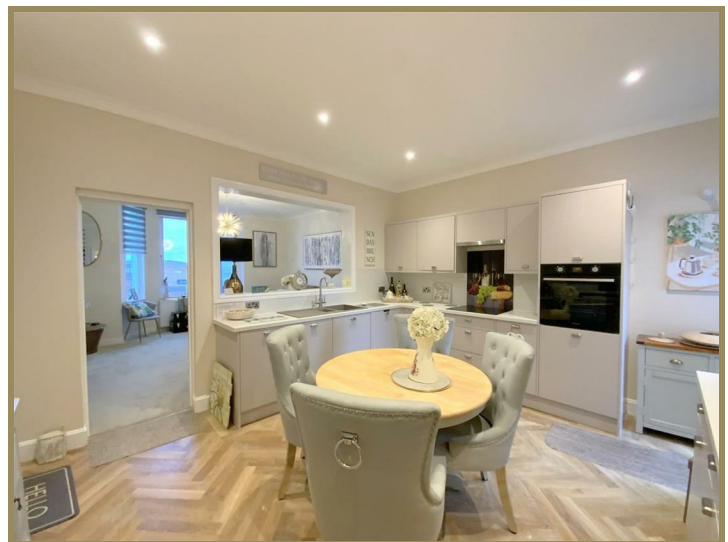
Flat 1, Eastcliffe 10-11 Highcliff Road, Cleethorpes, DN35 8RQ £220,000